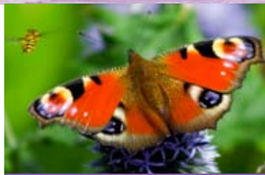
Biodiversity and Ecosystem Service