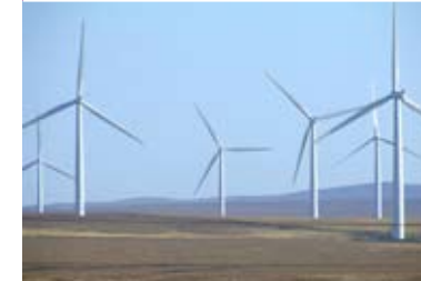
Responding to Climate Change