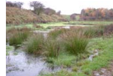
Tackling Diffuse Pollution