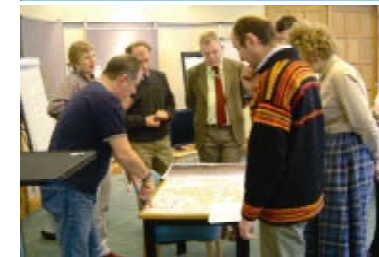
Governance & Policy