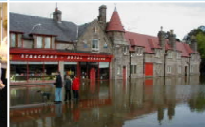
Strategies for the Future