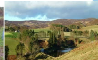
Water Use & Values